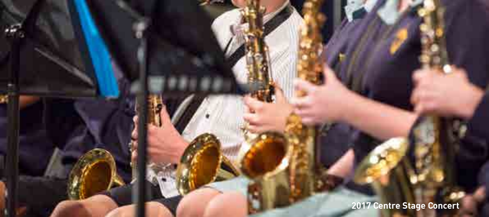
2017 Centre Stage Concert