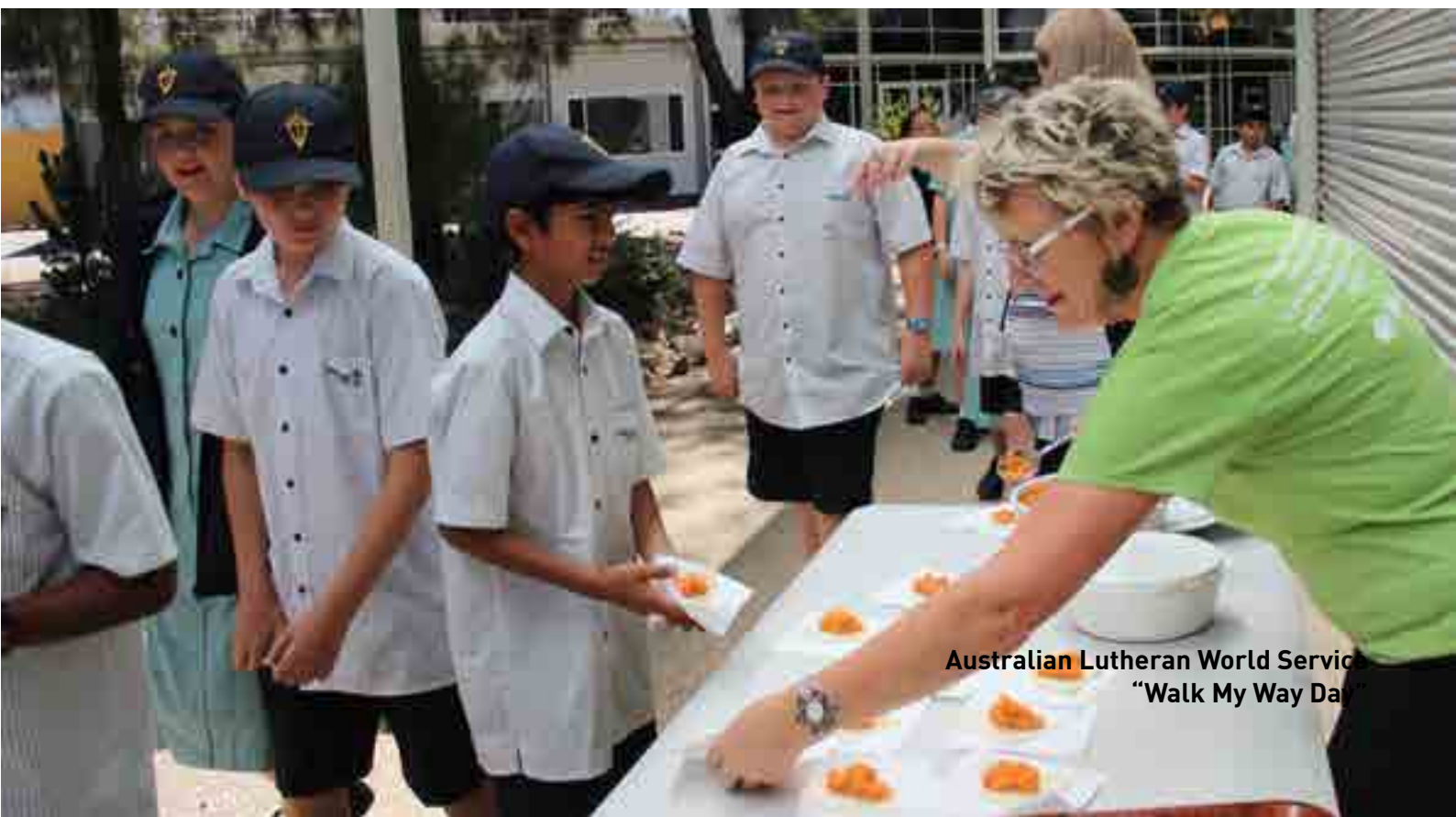
Australian Lutheran World Service "Walk My Way Day"

Restorative Practice is a relational process which shows the value of healthy relationships in the teaching and learning process. At Endeavour we have seen the benefits of adopting restorative approaches to all matters relating to behavior management. The gift in this approach is a new language to define how we think about and manage student behavior and our response as educators. Behavior management may be more appropriately called relationship management.