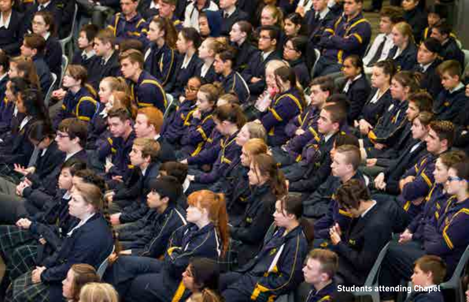
Students attending Chapel