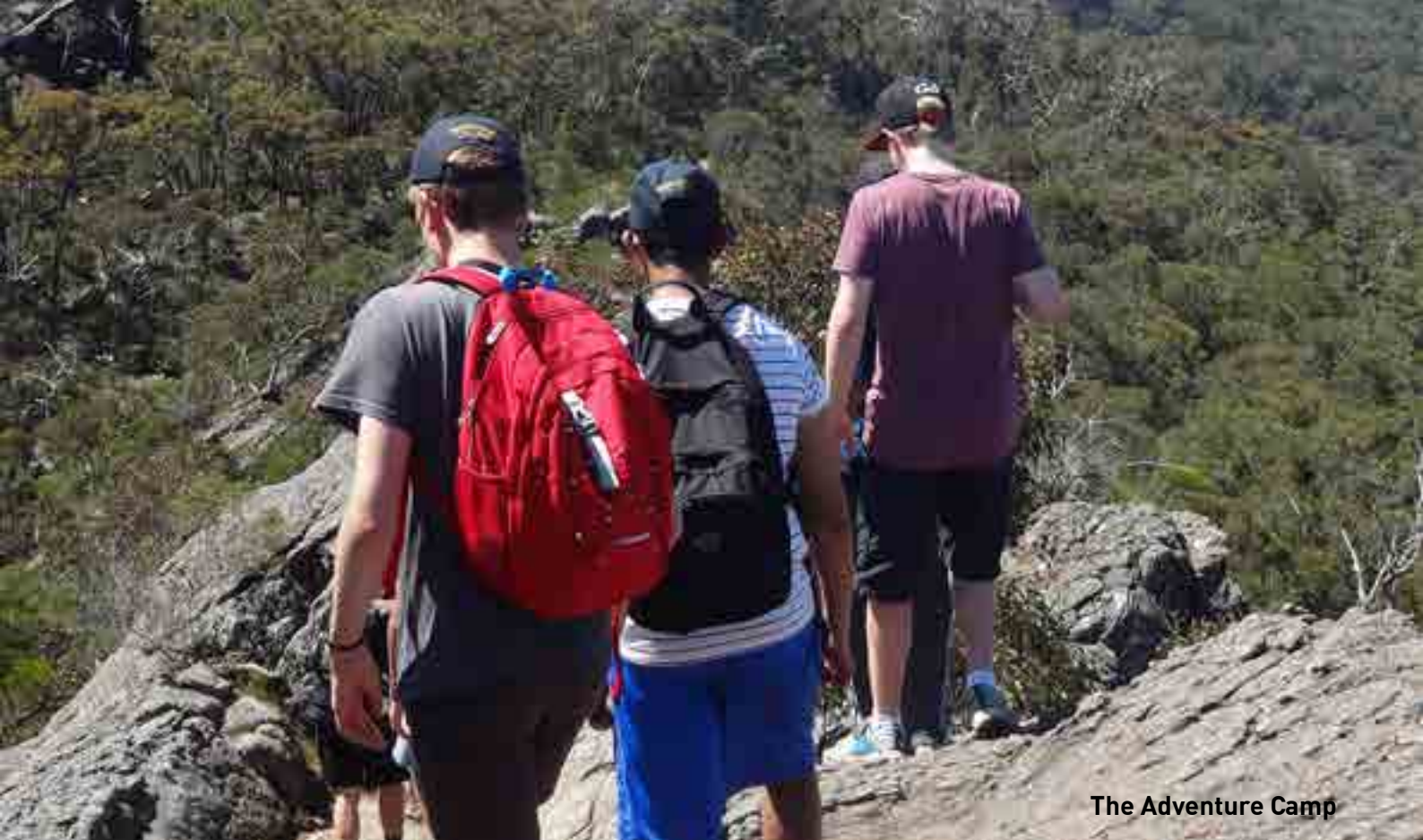
The Adventure Camp