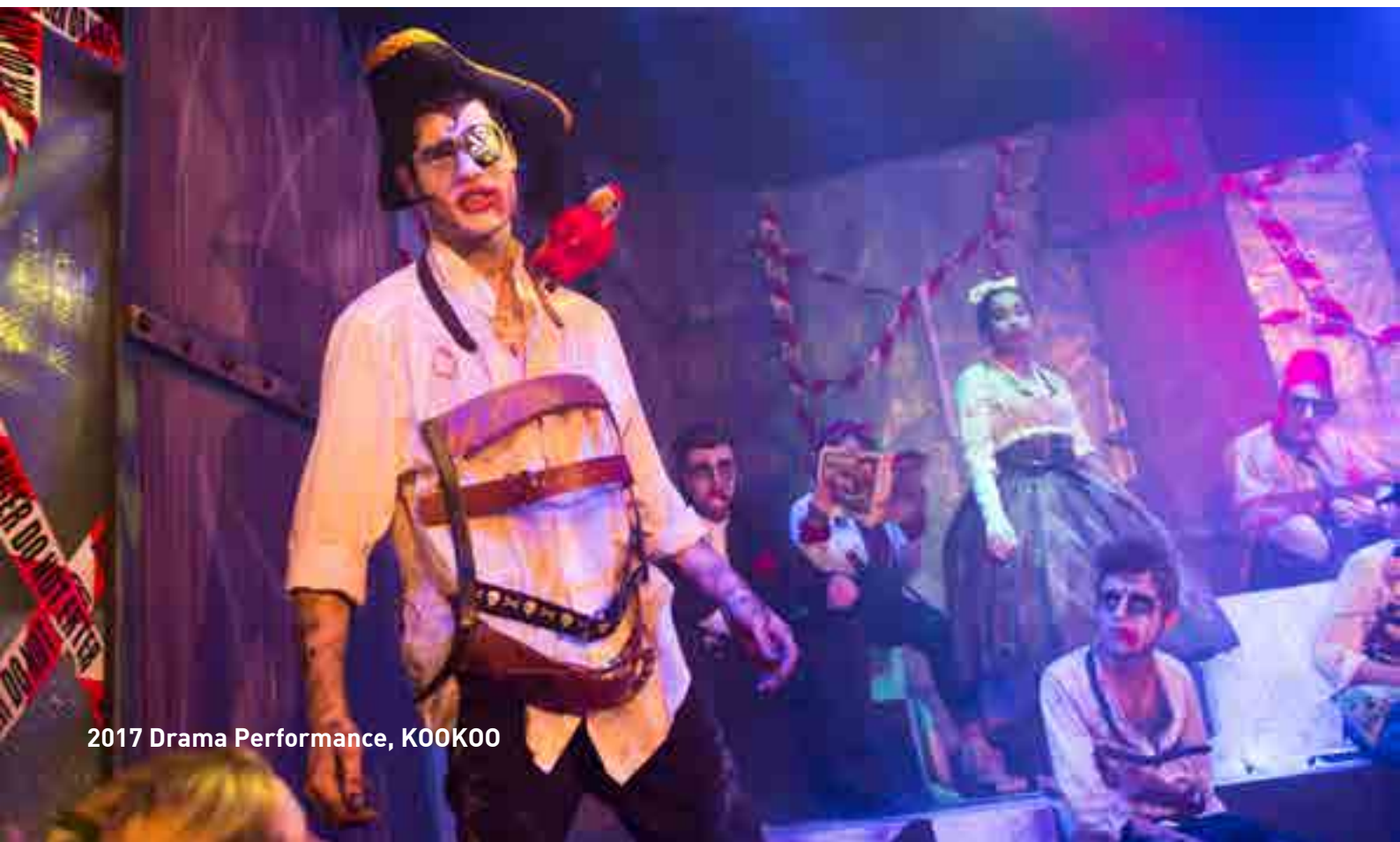
2017 Drama Performance, KOOKOO

Total Gross Income $11,448,226 (excluding income from government capital grants)