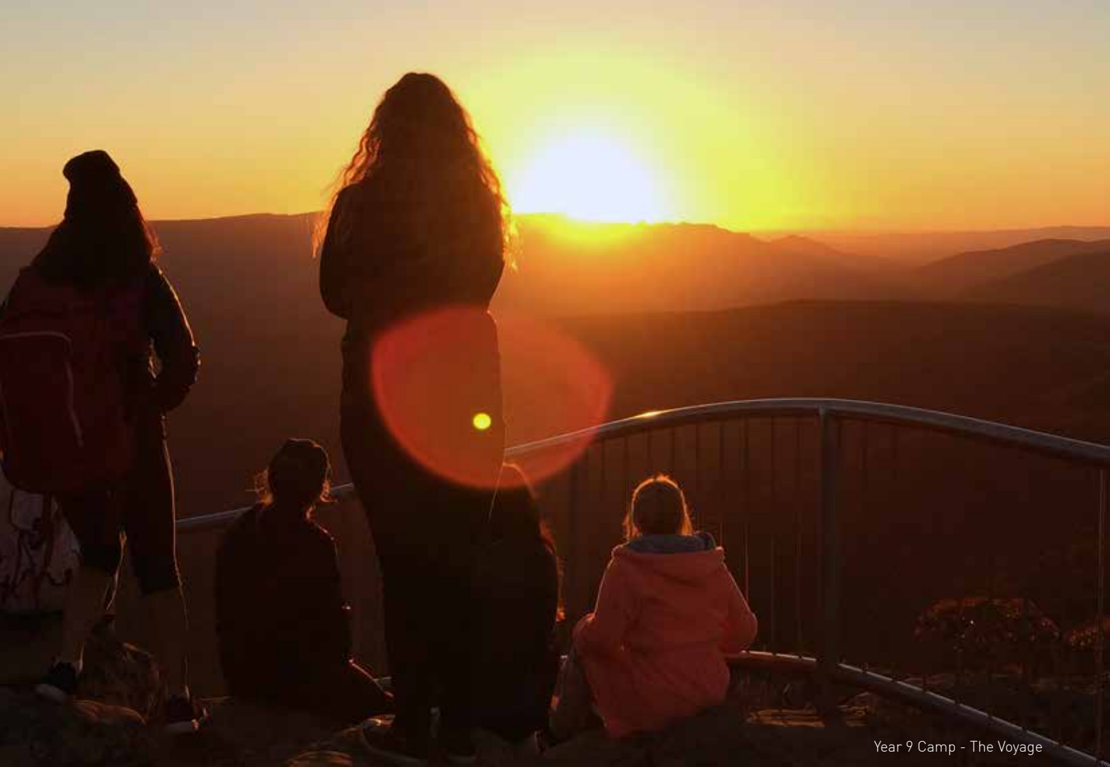
Year 9 Camp - The Voyage