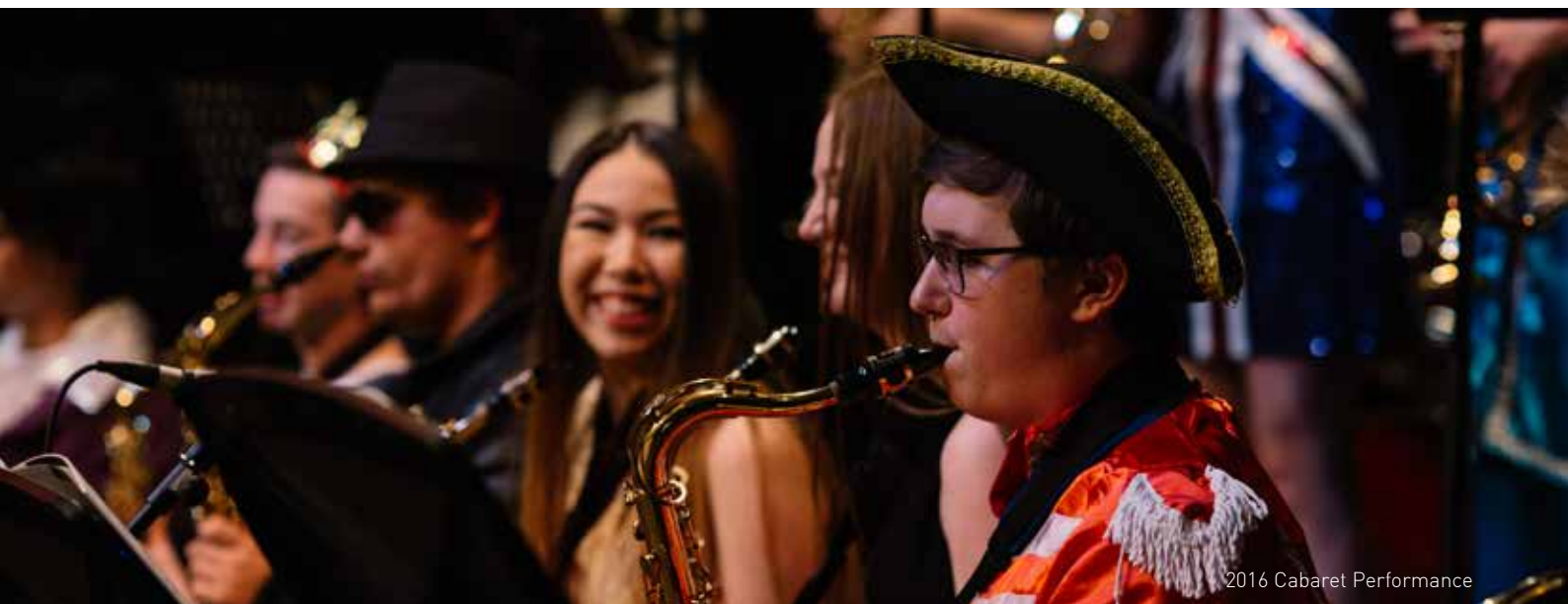
2016 Cabaret Performance

Beyond the sporting, music and chess program Endeavour offered public speaking and other extra-curricular opportunities for students.